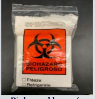
Biohazard bag w/ absorbent material