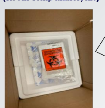
Ice packs, styrofoam box insert (Wet/Dry Ice kit/Mailer)