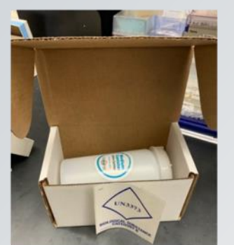
Small cardboard box (Room Temp mailer/kit)