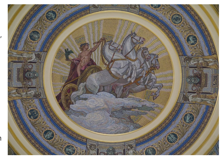
Figure: Image of Helios in his chariot, from Dome of the entrance hall of the Széchenyi Bath, Budapest, Northern Hungary

And Santa Claus? Perhaps his sleigh and reindeer derive from Helios, the god and personification of the sun, who travelled in a chariot pulled across the sky by horses.